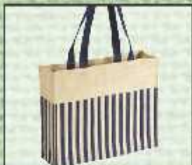
PR/13 15X16X4 ₹ 175