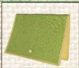
FF/17 15X13 ₹ 175