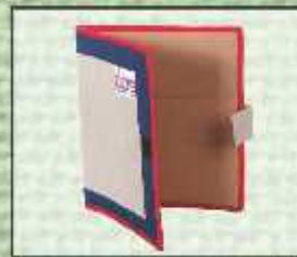
FF/15 14X10X1 ₹ 200