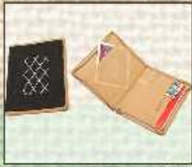
FF/01 15X12X1 ₹ 250