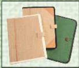
FF/09 14X10 ₹ 150