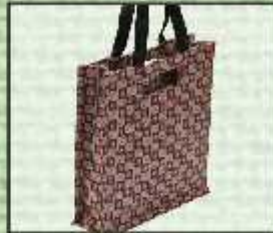
PR/10 10X10X5 ₹ 160