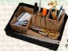
G/10 ₹ 300