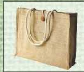
PR/11 14X15X4 ₹ 175