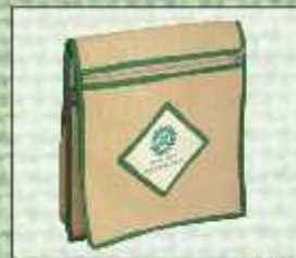
OB/15 15X12X4 ₹ 250