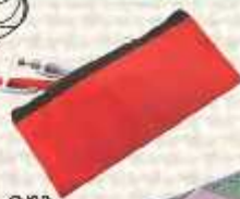
G/08 ₹ 50