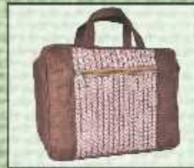
OB/35 13X16X4 ₹ 350