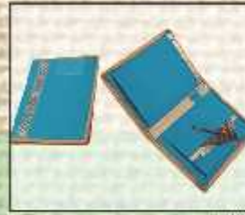
FF/03 15X12X1 ₹ 250