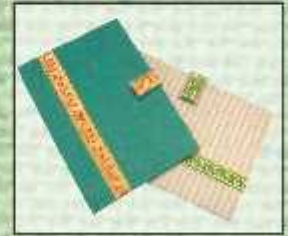
FF/08 12X10 ₹ 200