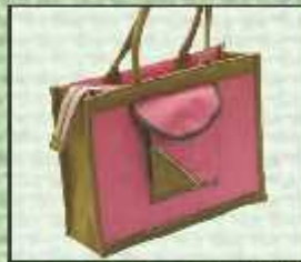
RB/06 15X13X4 ₹ 225