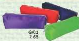
G/03 ₹ 85