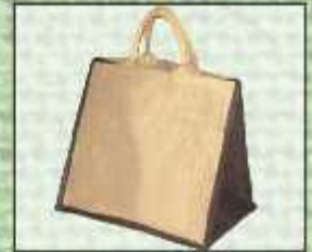
PR/12 15X13X4 ₹ 225