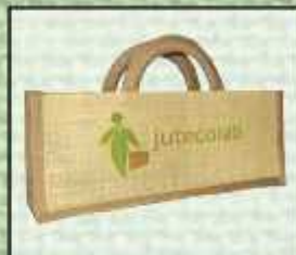
PR/14 10X16X4 ₹ 185