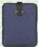
G/01 (pac) ₹ 200