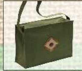
OB/03 12X15X4 ₹ 250