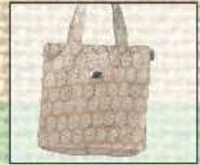
OB/24 14X12X4 ₹ 225