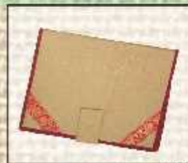
FF/19 14X10 ₹ 200