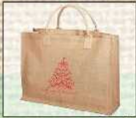
PR/01 14X16X4 ₹ 200