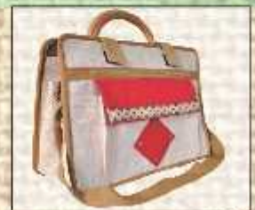
OB/20 12X15X5 ₹ 350

Contact us for an Instant Quotation +91-9919994422