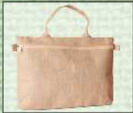
PR/09 11X15 ₹ 140