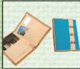
FF/06 15X12 ₹ 200