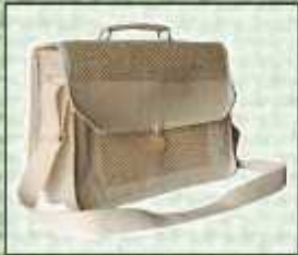
OB/25 13X14X4 ₹ 450