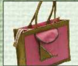
OB/31 14X10X4 ₹ 300