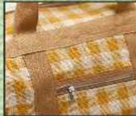
OB/30 13X15X5 ₹ 450