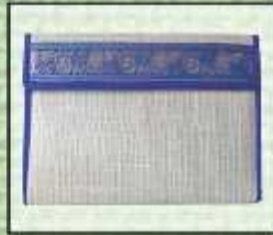
FF/10 12X15 ₹ 250