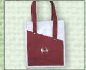
OB/28 12X15X3 ₹ 225