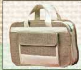
OB/02 12X15X5 ₹ 350