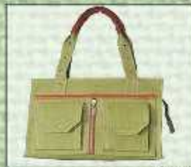
OB/14 11X14X4 ₹ 250