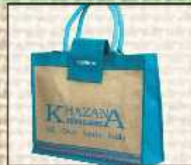
OB/39 14X13X4 ₹ 175