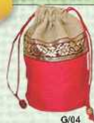
G/04 ₹ 200