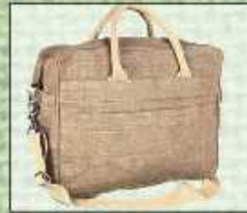
OB/11 12X15X4 ₹ 350