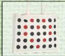
RB/10 15X15X4 ₹ 200