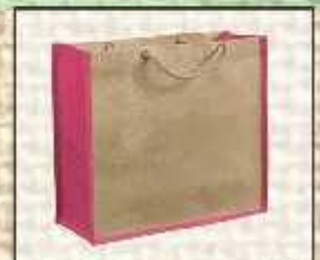
PR/20 14X14X4 ₹ 130