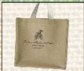
PR/17 15X15X4 ₹ 150