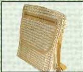
OB/33 14X12X5 ₹ 200