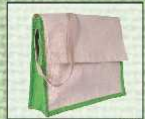
OB/36 12X15X4 ₹ 200