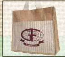
OB/23 12X15X4 ₹ 250