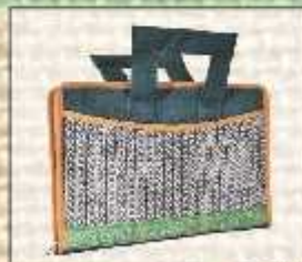
OB/18 11X14X1 ₹ 250