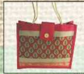
RB/03 14X16X4 ₹ 200