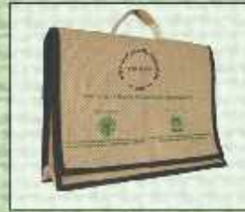
OB/07 12X15X5 ₹ 300