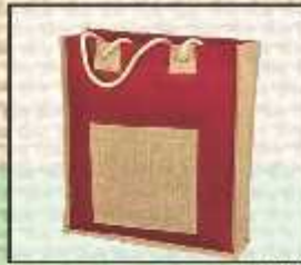
RB/02 12X13X4 ₹ 200