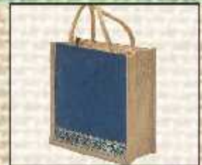
OB/40 12X10X4 ₹ 175