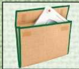
FF/14 12X15 ₹ 175