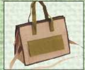
OB/12 11X15X5 ₹ 265