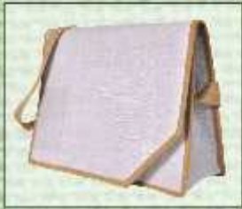
OB/05 12X14X4 ₹ 275