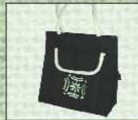
RB/11 15X12X4 ₹ 200