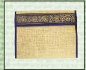
FF/12 12X15 ₹ 250