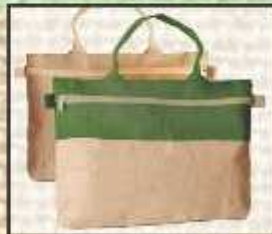
OB/38 11X15 ₹ 250