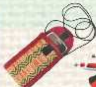
G/07 ₹ 75