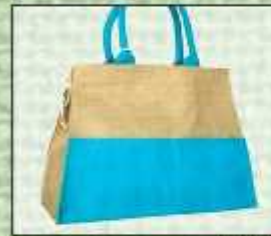
RB/07 15X15X4 ₹ 190