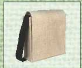
OB/16 12X12X4 ₹ 200