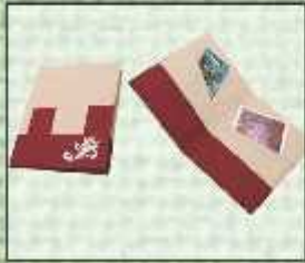
FF/05 15X12 ₹ 300