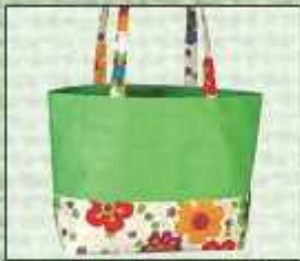
RB/05 12X15 ₹ 200