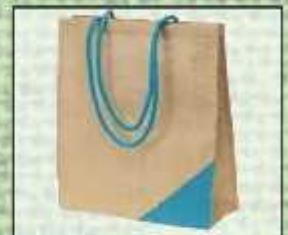
PR/16 14X12X4 ₹ 175