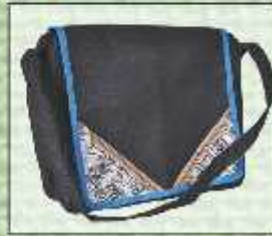
OB/06 12X14X4 ₹ 285