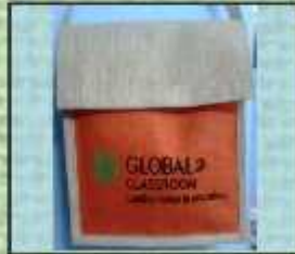
OB/26 12X11X4 ₹ 200