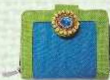
G/02 ₹ 140