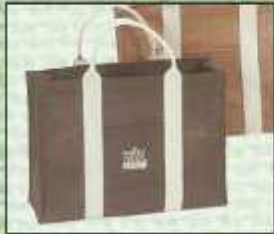
PR/05 16X16X4 ₹ 160