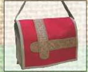
OB/04 12X15X5 ₹ 350