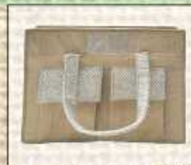
OB/19 11X15X5 ₹ 300