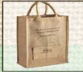
PR/02 16X14X4 ₹ 225