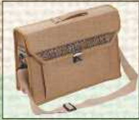
OB/01 12X15X5 ₹ 400