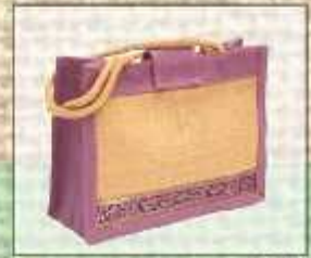
RB/04 14X16X4 ₹ 175