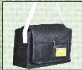
OB/34 10X12X3 ₹ 300