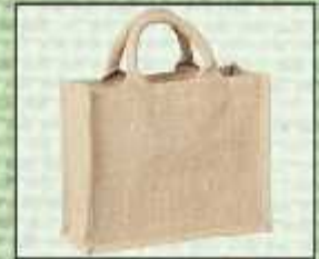
OB/32 15X12X4 ₹ 225