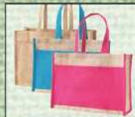
PR/15 11X15X4 ₹ 200