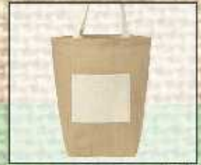
PR/04 16X12 ₹ 130