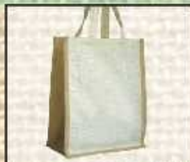
PR/18 16X10X4 ₹ 150