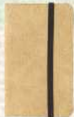
G/06 ₹ 175