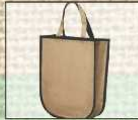
PR/03 16X12X4 ₹ 175