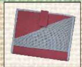
FF/20 14X11 ₹ 200