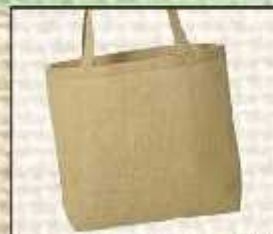
PR/19 15X14 ₹ 125