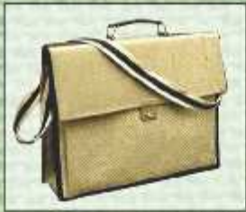
OB/09 12X15X5 ₹ 400