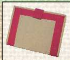
FF/18 14X12 ₹ 200