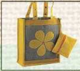
RB/01 14X12X3 ₹ 225