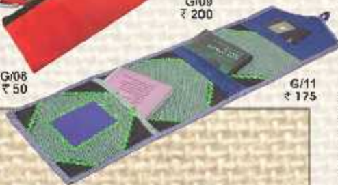
G/11 ₹ 175