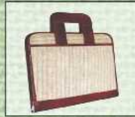
FF/07 12X15 ₹ 275