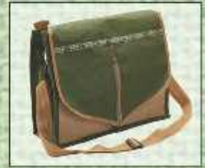
OB/08 12X15X4 ₹ 275