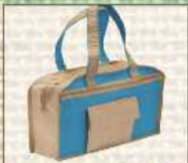
OB/17 12X15X5 ₹ 225