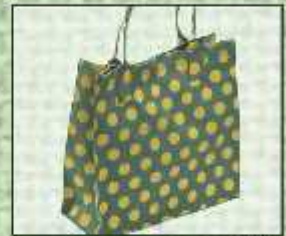
RB/08 15X15X5 ₹ 200