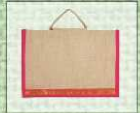
PR/08 14X15X3 ₹ 175