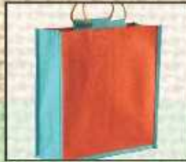
OB/22 15X12X3 ₹ 225