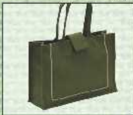
RB/09 13X15X4 ₹ 175