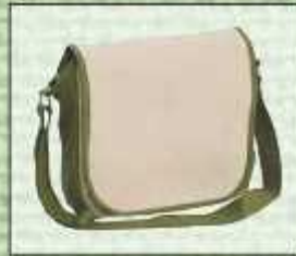
OB/10 12X14X4 ₹ 250