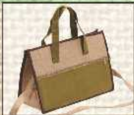
OB/37 11X15X5 ₹ 250