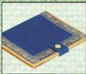
FF/13 14X11 ₹ 200