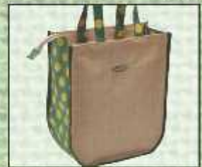
RB/12 12X13X4 ₹ 200