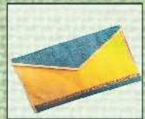
FF/16 12X15 ₹ 150