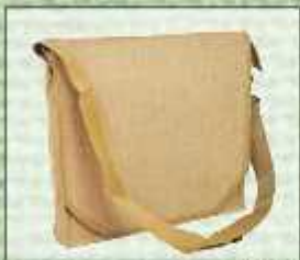
OB/13 12X15X4 ₹ 250