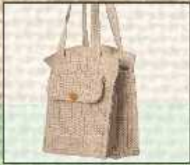
OB/21 14X12X5 ₹ 300