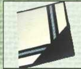
FF/11 15X12 ₹ 250