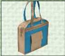
OB/29 12X15X5 ₹ 300