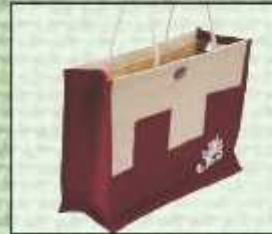
OB/27 13X14X4 ₹ 350