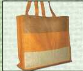
PR/06 16X16X4 ₹ 200