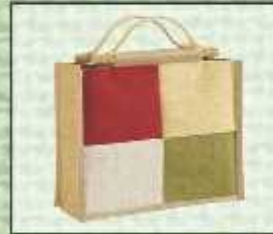
PR/07 15X15X4 ₹ 250